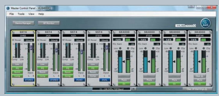
System Architect Plug In with SST 4 and SR 4000 Stripes